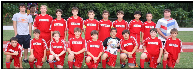
Congratulations to all our Athletes on a great season!

Building on last year's Principal's Cup Award, the 2011-2012 Mustangs are off to a winning start! The JV Boys Soccer team lost 1-0 in a hard-fought Championship Game at Bishop Moore Catholic High School on October 17. Immediately following the JV game, the SJV Varsity Boys Soccer team rallied to win the CMAC Championship. The Varsity Girls Basketball also had a winning season and placed 3 rd in the CMAC tournament.